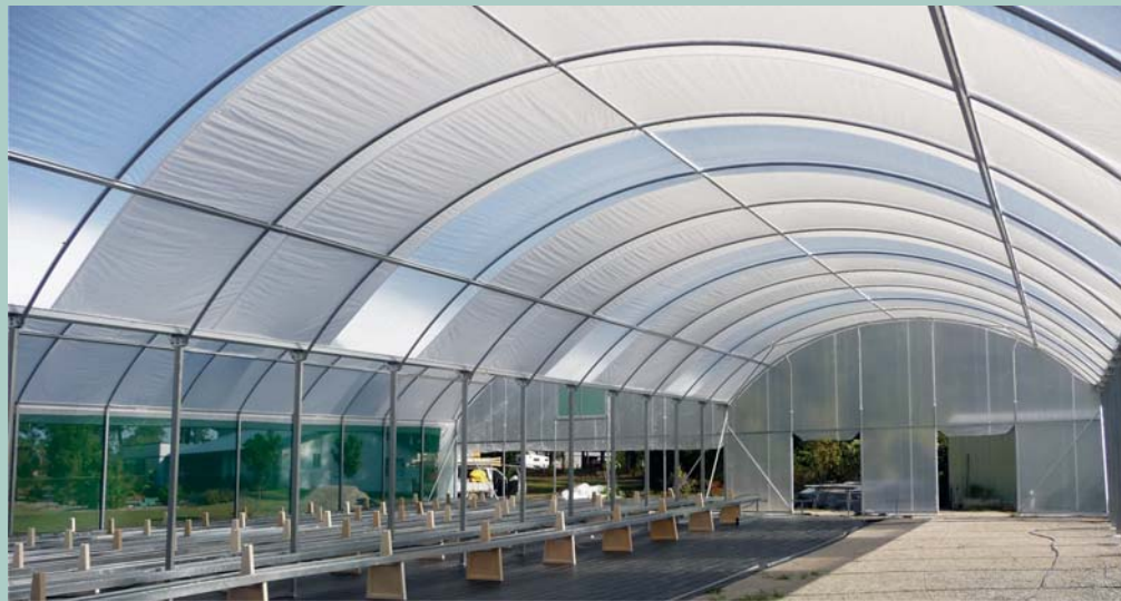
10m wide Gutter Connected