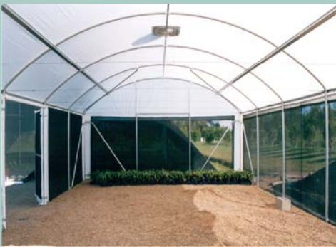
6m wide 'Straightwall' Tunnelhouse

Custom Built Tunnels up to 12m wide – Single Span or Gutter Connected