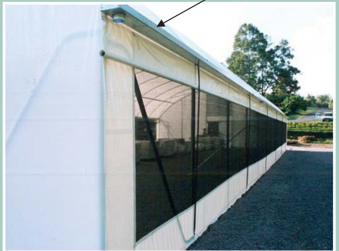
Gutters for water collection