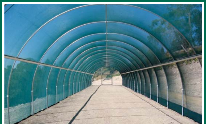
6m wide – Shadecloth Cover