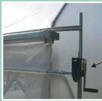
Winch operated roll-up sides