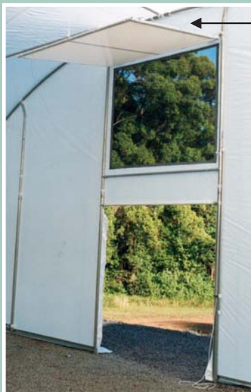
Pulley operated Tilt Vents