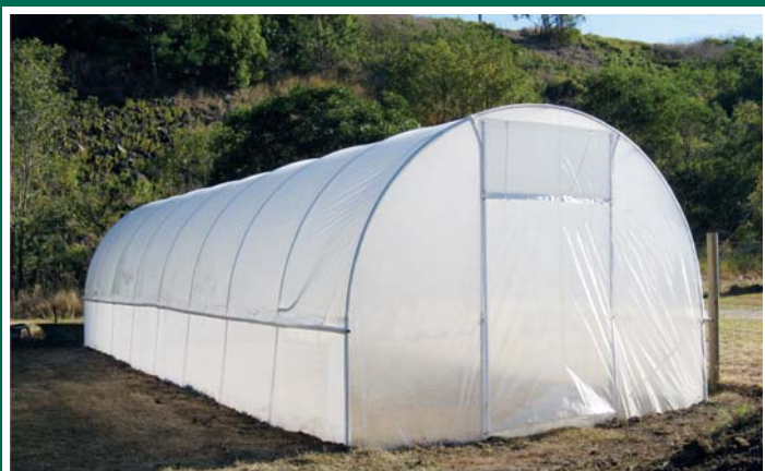
4.2m wide – Waterproof Plastic Cover