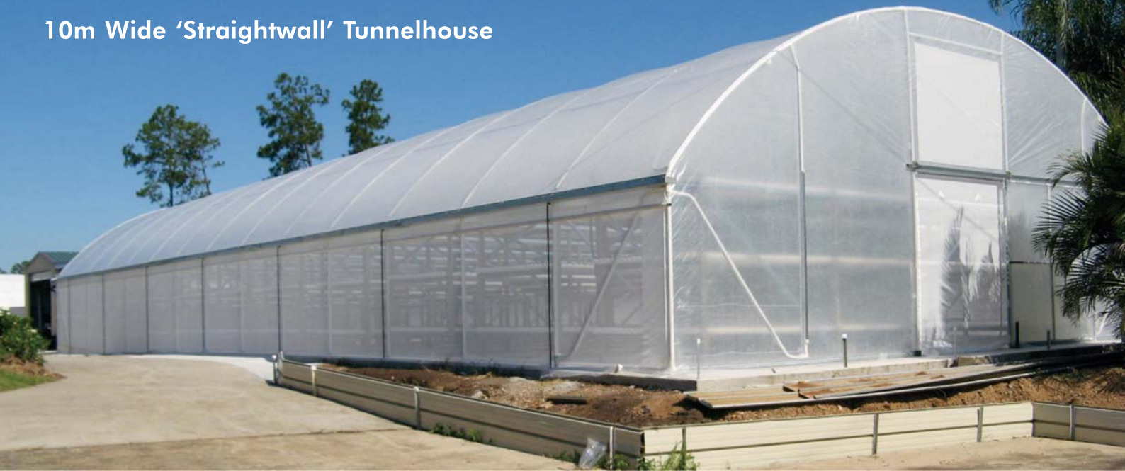
10m Wide 'Straightwall' Tunnelhouse